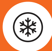
Cooling Rental Solutions