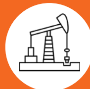
Oil Field Equipment & Protective Coating